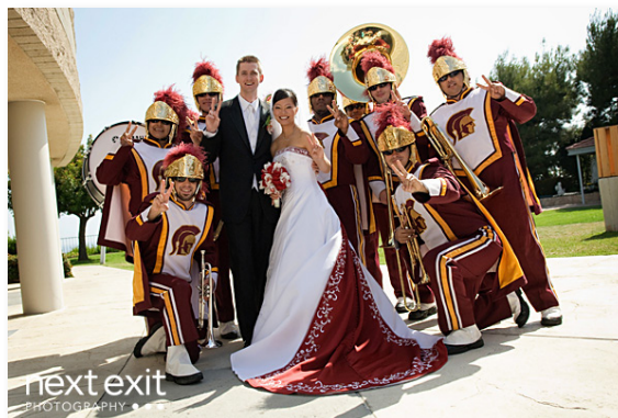
A 10-PIECE AT A WEDDING

On average, the band is on the road performing at an event nearly every day. In recent years, the ensemble has traveled to Dallas, Boston, San Francisco, and Las Vegas. The 10-Piece Band is comprised of four trumpet players, three trombonists, two drummers – one each on bass drum and snare drum – and a tuba player. Larger ensembles are also available for hire depending on availability. Payment for the 10-Piece Band's services is made in the form of a donation to the TMB.