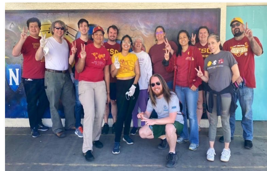
TMB ALUMNI AT THE DAY OF SCERVICE