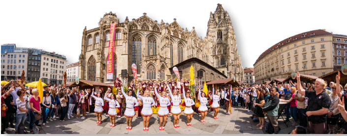
📍 Salzburg 📍 Hallstatt 📍 Vienna 📍 Prague 📍 Munich