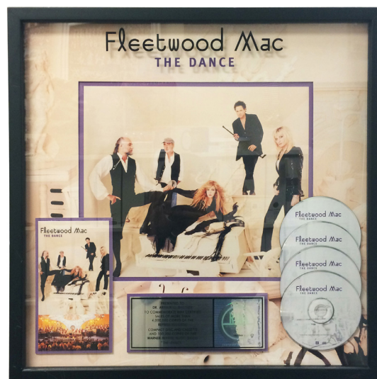
PLATINUM ALBUM FROM THE DANCE