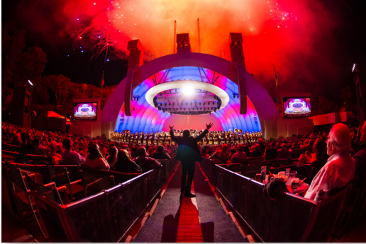
HOLLYWOOD BOWL TCHAIKOVSKY SPECTACULAR

Bowl each summer with a regular engagement for the Tchaikovsky Spectacular with the Los Angeles Philharmonic.