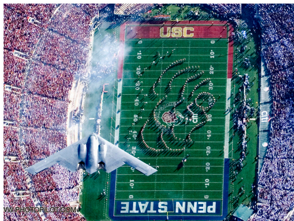
2009 ROSE BOWL PREGAME