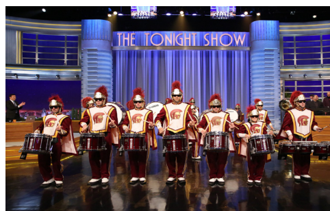
THE TONIGHT SHOW (2016)