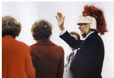
President Ronald Reagan

Liza Minnelli President Richard Nixon President Barack Obama Shaquille O'Neal Gwyneth Paltrow Rosa Parks Pope John Paul II Brad Pitt Red Hot Chili Peppers