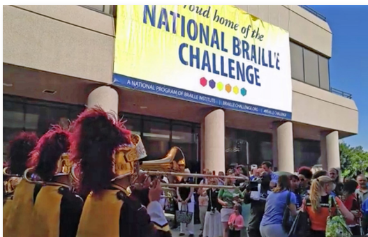
PERFORMING FOR THE BRAILLE INSTITUTE

As long as USC is engaged in the community, TMB members will be its ambassadors, helping others in the way they know best: with music, dedication and a powerful dose of the Trojan Marching Band.