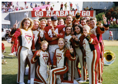
ON THE SET OF FORREST GUMP (ABOVE)