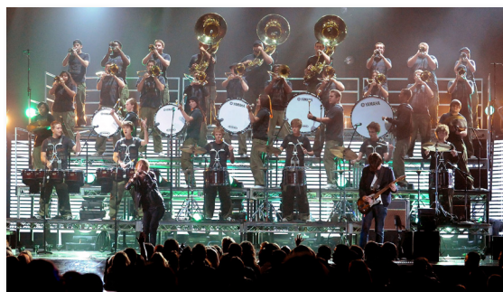
ON STAGE AT THE 2009 GRAMMYS

In what was called "one of the most stunning and mysterious live performances on network television," 30 TMB members joined Thom Yorke and Jonny Greenwood of Radiohead for a rendition of "15 Step" at the 51st Grammy Awards on Feb. 8, 2009. The OC Register called it "Tusk' for a new age" and it received raves from Rolling Stone , Entertainment Weekly , and the L.A. Times , to name a few. Radiohead later gave the TMB special permission to release a rehearsal recording of the collaboration on the band's album, Trojan Legacy . It was the TMB's second appearance on the Grammys. In 2004 they joined André 3000 of OutKast for "Hey Ya" to close that year's ceremony.